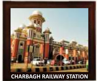
CHARBAGH RAILWAY STATION