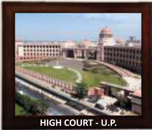
HIGH COURT - U.P.