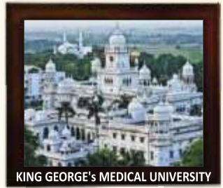
KING GEORGE'S MEDICAL UNIVERSITY